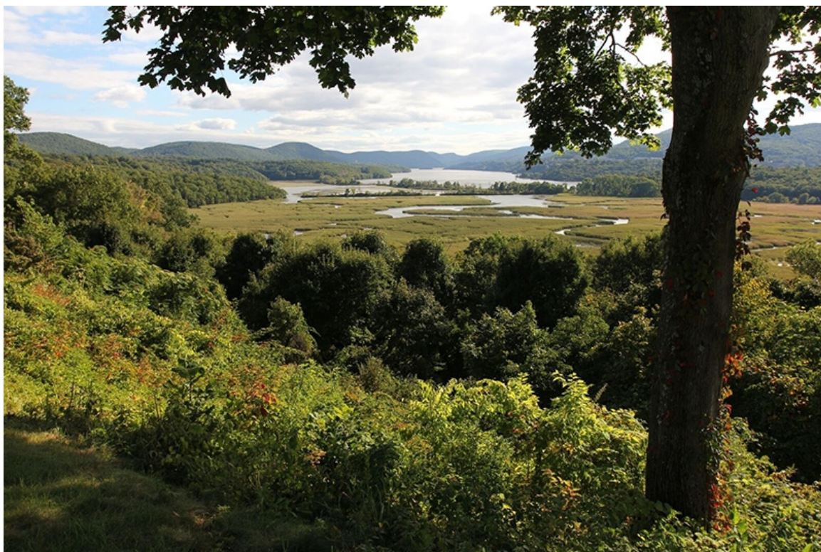
A scenic Hudson Valley view